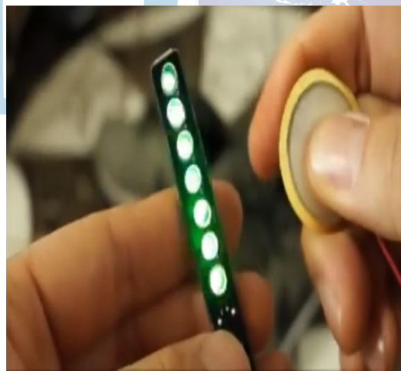
Fig:2. Piezoelectric transducer