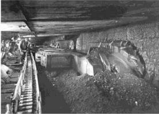
Figure 1. Long wall

The production and productivity of individual, continuous, and long wall production units have increased consistently over the years.