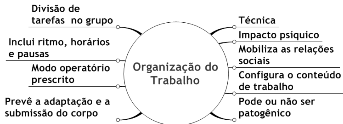
Figure 2 : Work organization Components