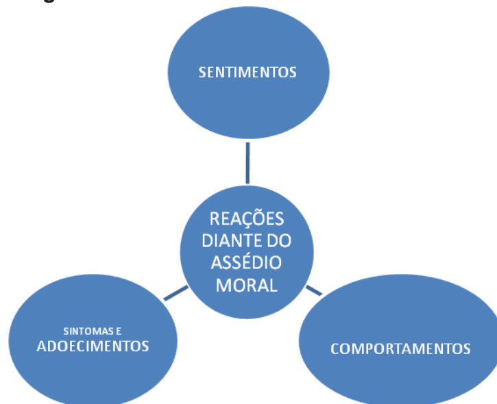
Figure 03: the Moral Harassment Reactions

In Figure 03 below , presents the reactions of bullying .