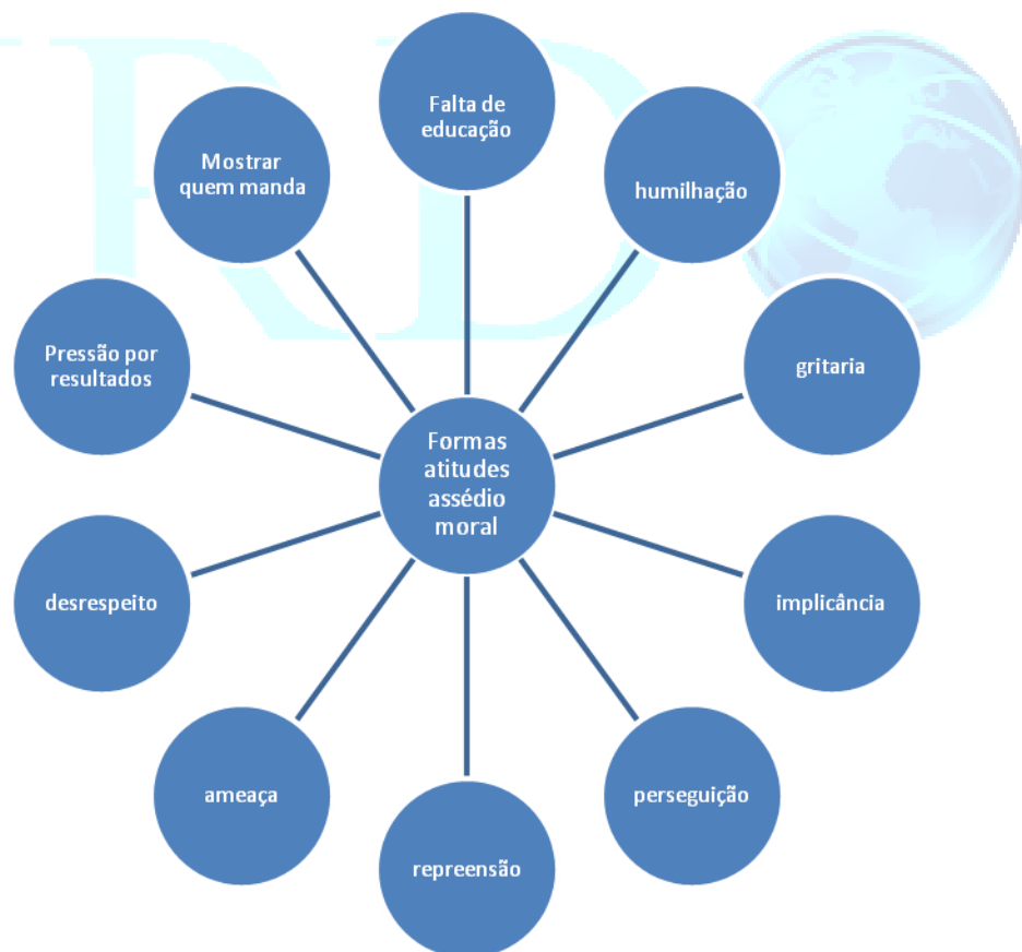
Figure 1: Bullying Attitudes

To be characterized bullying there is some stalker following attitudes: