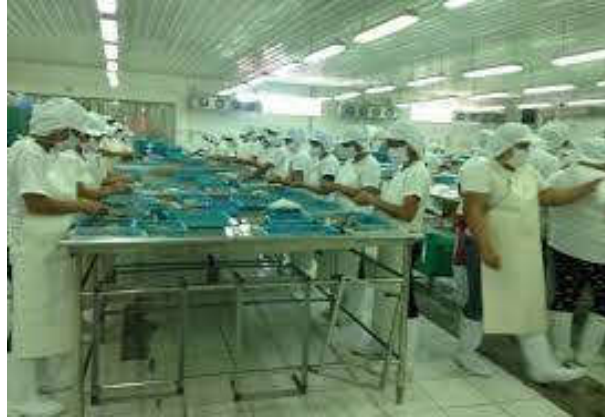
Fig. 1. BAMDECOR good manufacturing practice (GMP)

Food safety is everybody's concern. Bohol Aqua Marine Development Corporation (BAMDECOR) of Bohol, Philippines one of the Hazard Analysis Control Point (HACCP) accredited industry workers (Fig.1) observed good manufacturing practices to ensure food safety. As our food supply becomes increasingly globalized, the need to strengthen food safety systems in and between all countries is becoming more and more evident. That is why WHO is promoting efforts to improve food safety, from farm to plate (and everywhere in between) on World Health Day. 2015